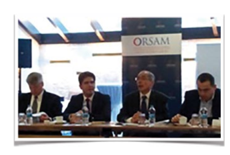
The Continuously Changing Middle East Conference Istanbul, Turkey