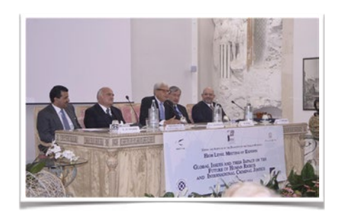
International Affairs and Its Impact on The Future of Human Rights Conference Syracuse, Italy