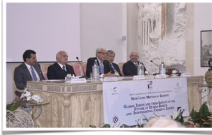
International Affairs and Its Impact on The Future of Human Rights Conference Syracuse, Italy