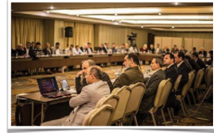
The State and Society Convention Istanbul, Turkey