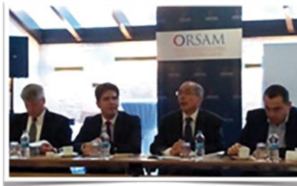
The Continuously Changing Middle East Conference Istanbul, Turkey