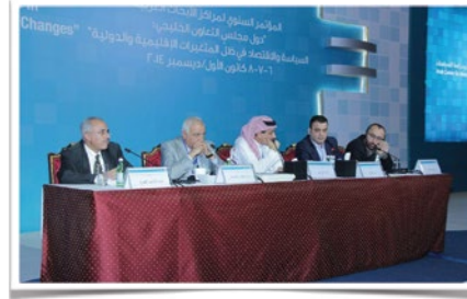
Conference on The International and Regional Impact on Politics and Economics Doha, Qatar