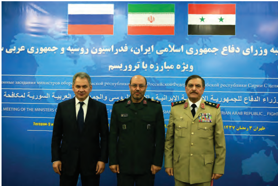
Defence Ministers of Iran (Hossein Dehqan), Russia (Sergei Shoigu) and Syria (Fahd Jassem al-Frej) met in Tehran to discuss the fight against opponents of the Syrian regime, on June 9, 2016.