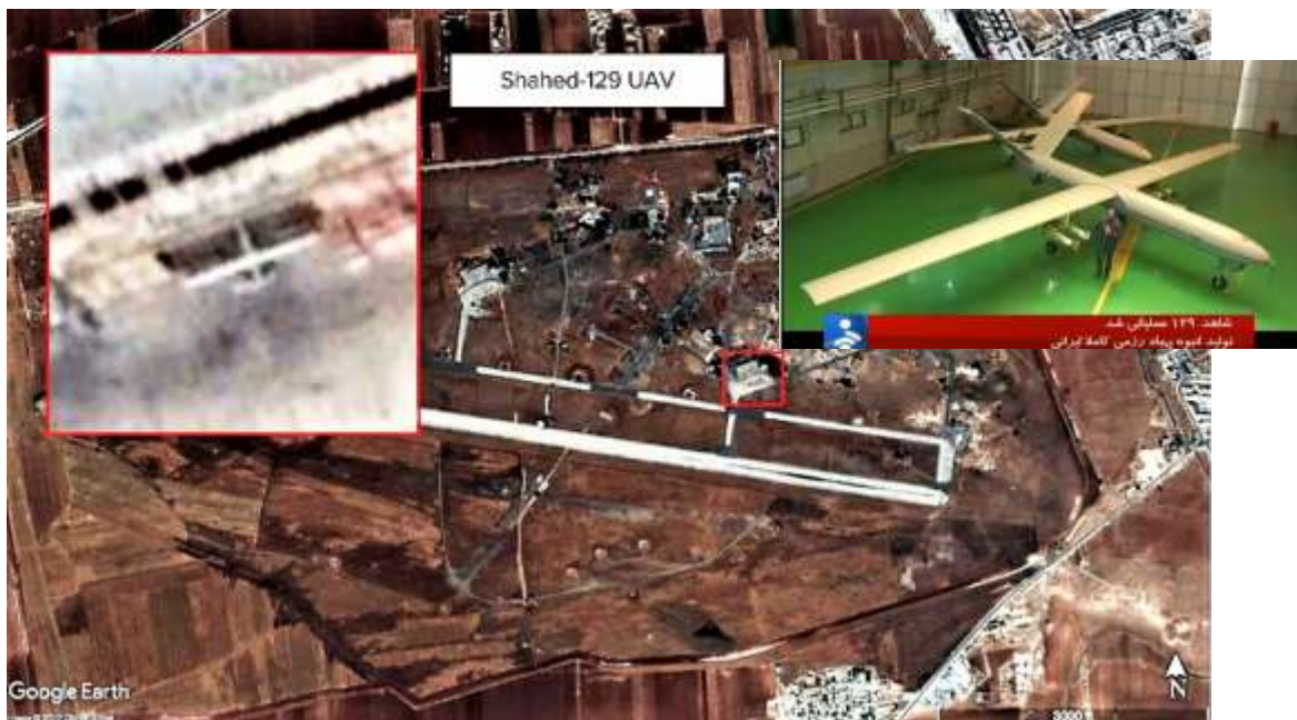
Iranian Shahed-129 drone at Hama airbase in Syria on 9 October 2017. On the same day, the city of Khan Sheikhoun in Idlib was hit by a drone strike. An inside source confirmed that the Iranian drone took off before the hit in 30m.