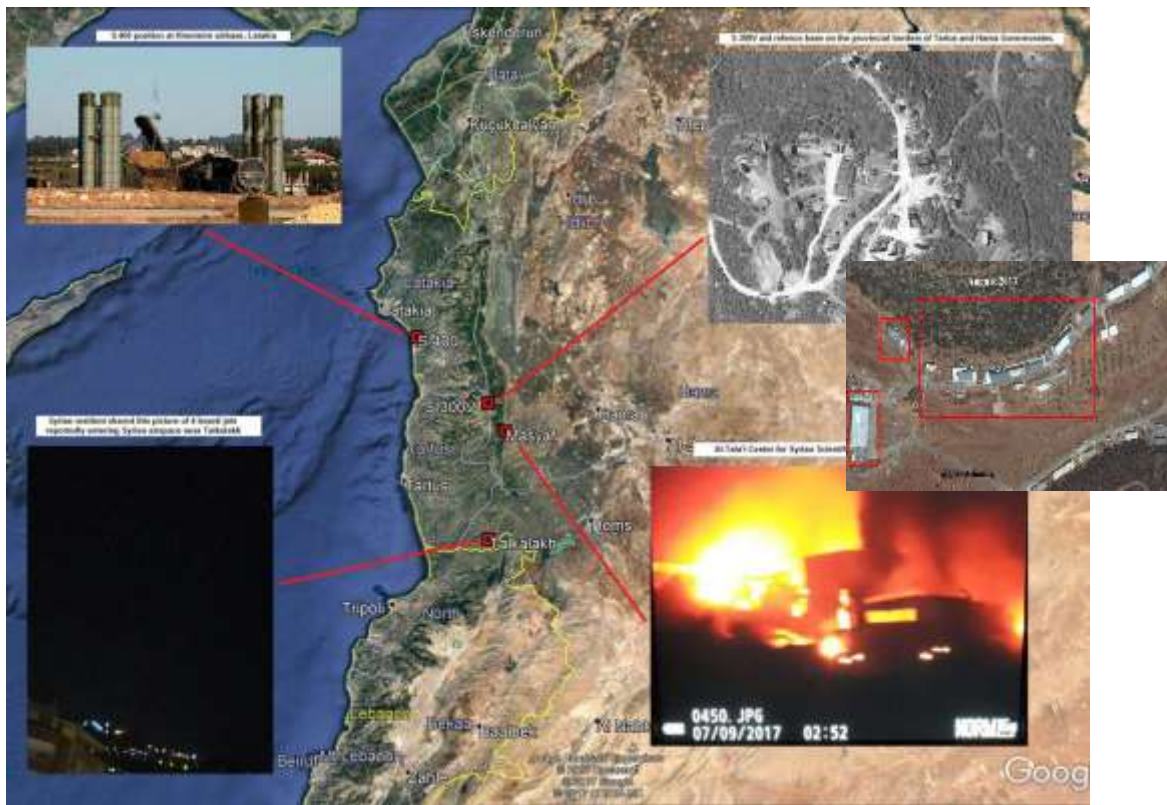
The Scientific Research Center in the city of Musayaf was targeted by an Israeli air strike on 7 September 2017. The entry of Israeli aircraft was from Lebanon over Telaklakh, and the Russian S300 system was only 15 km away from the target area and 60 km from the point where the aircraft entered.