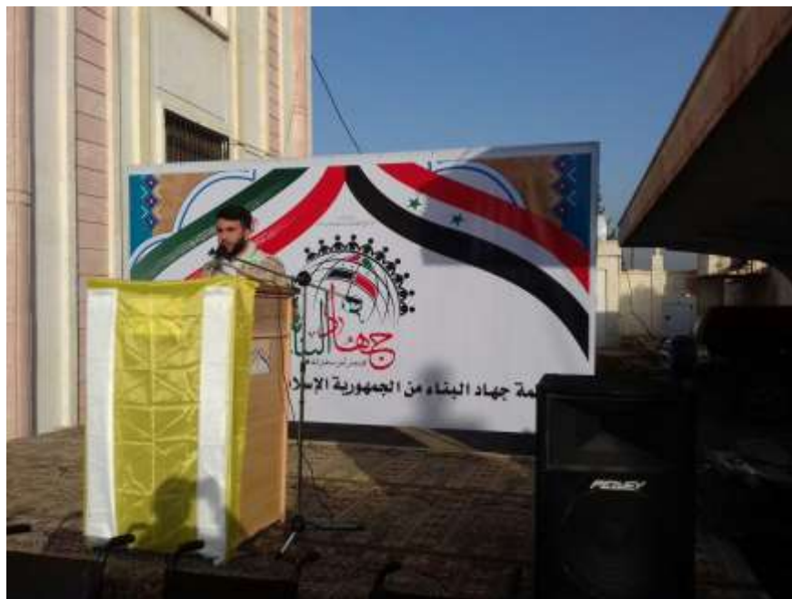
Representatives from Iran attended the ceremony and also Aleppo government and several of military leaders from SAA.