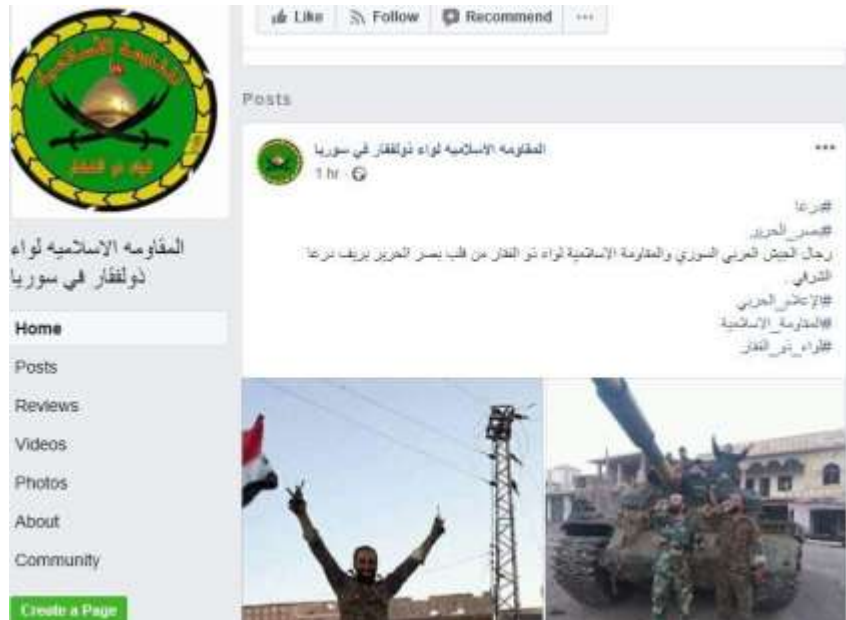
On June 27, Iranian-backed militia Zu Al-Fiqar Brigade officially declared its participation in the Daraa offensive

The images below were taken from official media accounts of the participating militias and from pro-regime accounts.