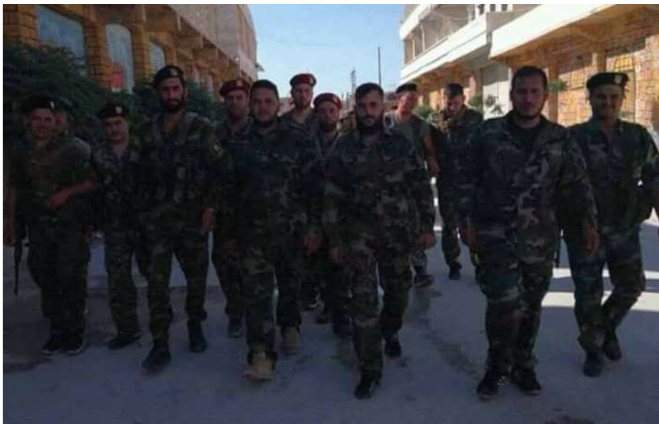
Rapid Intervention Forces and Special Operations Forces from the Imam Al-Baqir Brigade; both have been highly trained by military experts of the IRGC and Lebanese Hezbollah, and both declared their participation in Daraa offensive operations.